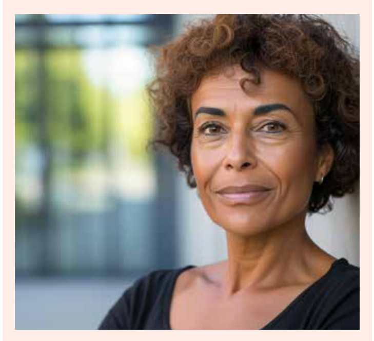
*Name and likeness have been changed.